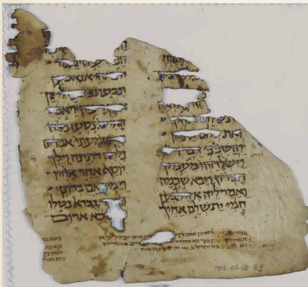
T-S AS 68.83 - Targum fragment containing Midrashic materials in the margins. M. Klein noted that the Aramaic Targum is presented in a similar manner to the Biblical Text, a mark of its liturgical role and canonical status. The Midrash is added as an exegesis.