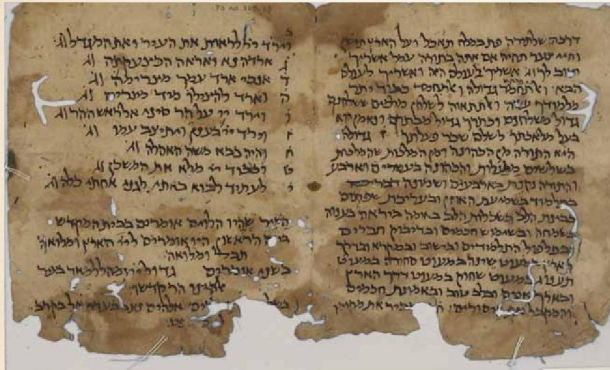
T-S NS 329.63 – A List of Verses. A unique version of a Midrashic list found in a Siddur.

The Haifa Project for the Study of Reception of Aggadic Midrash initiated a search for other relevant materials for the study of Midrah, hidden in unexpected fragments.