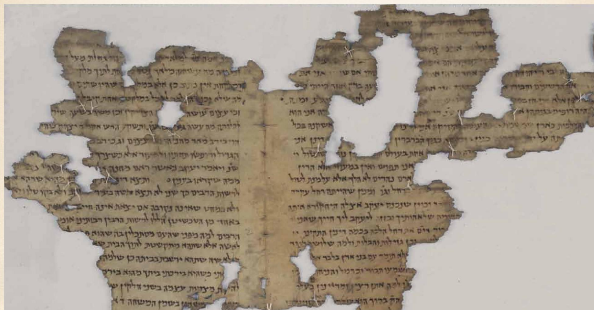
T-S Misc.36.198 / T-S C1.71 - Lost Aggadic Midrash – The Collection of Halakhic Proems. This work contains Halakhic proems for Genesis and Exodus. Each proem correlates a legal question with aggadic themes found in the weekly reading lection. More than 70% of the materials in this collection are not found in the known printed editions of the Midrash.

For more than a century the Genizah has provided us with important Aggadic and Midrashic materials including ancient versions of Midrashim, as well as many works that were previously unknown.