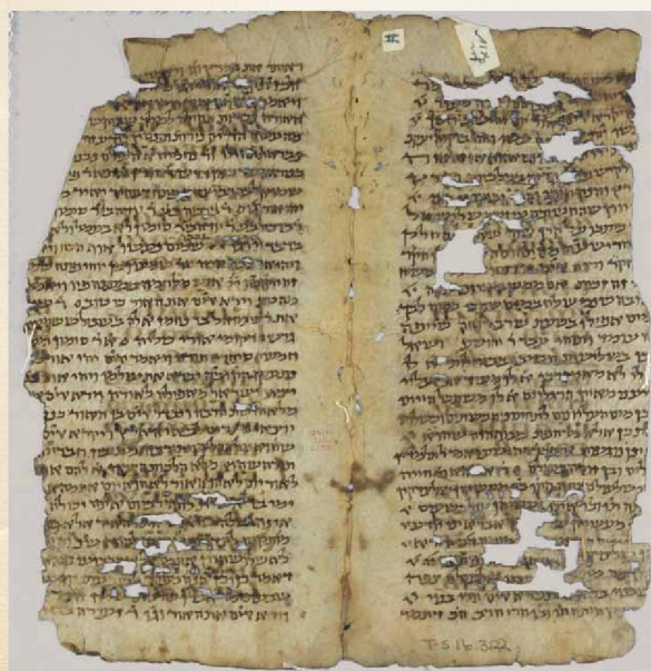
T-S 16.322-324 - One of the earliest versions of Genesis Rabbah, this fragment is a palimpsest. The parchment was previously used by Christians. Behind the Hebrew letters one can see traces in Syriac script a translation of Jeremiah.